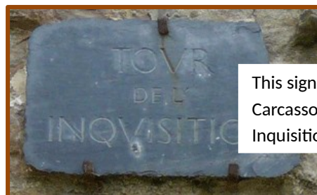
This sign marks the tower at Carcassonne where the Medieval Inquisition operated.

However, some people feel that, "Organized religion is nothing less than organized crime - aided and abetted by the gods of the day ." Jesuits are notorious 'word-smiths'. Those seeking to lead the world into believing the Antichrist will be a Muslim. Consequently, so much of the church today is unprepared for the real Roman Antichrist. They fail to recognize that Daniel 7 describes the fourth beast -(Daniel 7:7), which is none other than Rome. But I deal with this topic in greater detail in my forthcoming series on the Antichrist "Beast" in my forthcoming series on the System".