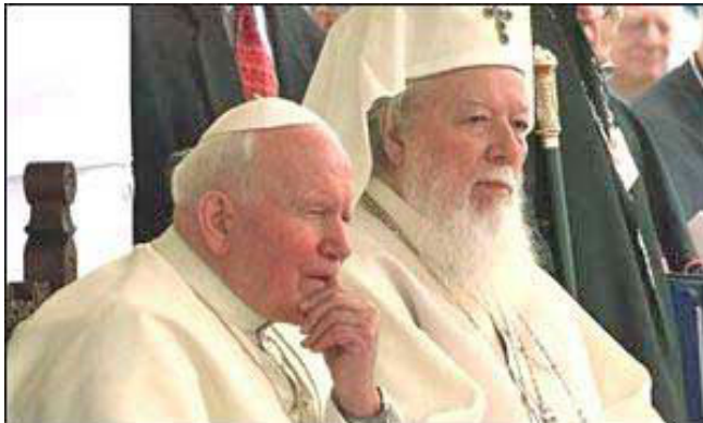
Pope and Patriarch Teochist

Q. —Go ye, then, into all the world and take possession of all lands in the name of the Pope. He who will not accept him as the Vicar of Jesus and his Vice-regent on earth, let him be accursed and exterminated."