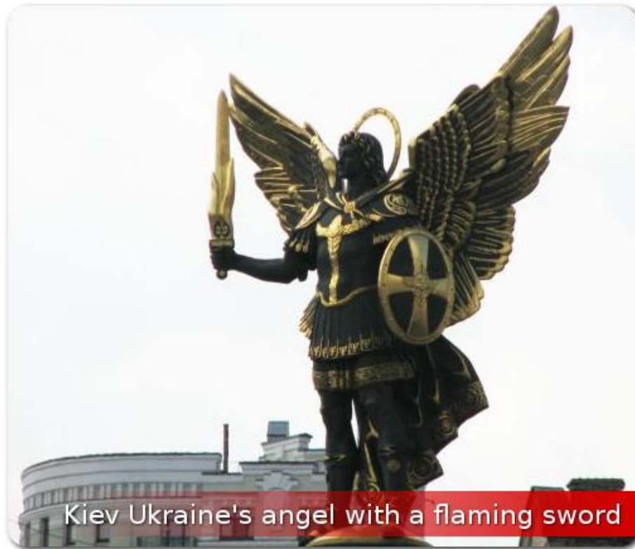
Kiev Ukraine's angel with a flaming sword

Pointing to the earth with his right hand, the angel cried out in a loud voice: “Penance, penance, penance!”