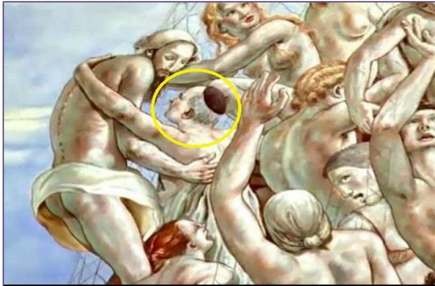
Cathedral mural depicting Archbishop Vincenzo Paglio clutching semi-nude man

Archbishop Paglia defended the mural deemed by Catholic critics to be “blasphemous” and “disgusting,” as well as “demonic,” saying it was part of a commitment to evangelizing. Regarding his inclusion in the mass of nude bodies shown in the mural, he said, “ I too am included in the mural as one who needs redemption no less than anyone else. ”