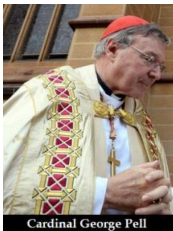
Cardinal George Pell

Wesolowski was charged with sexually abusing minors and child porn possession; if convicted, he would face 12 years in jail. Scheduled for July 11, 2015, his trial was postponed because of an "unexpected illness". On August 27, 2015, Wesolowski was found dead in his residence from a heart attack. -( Wikipedia )