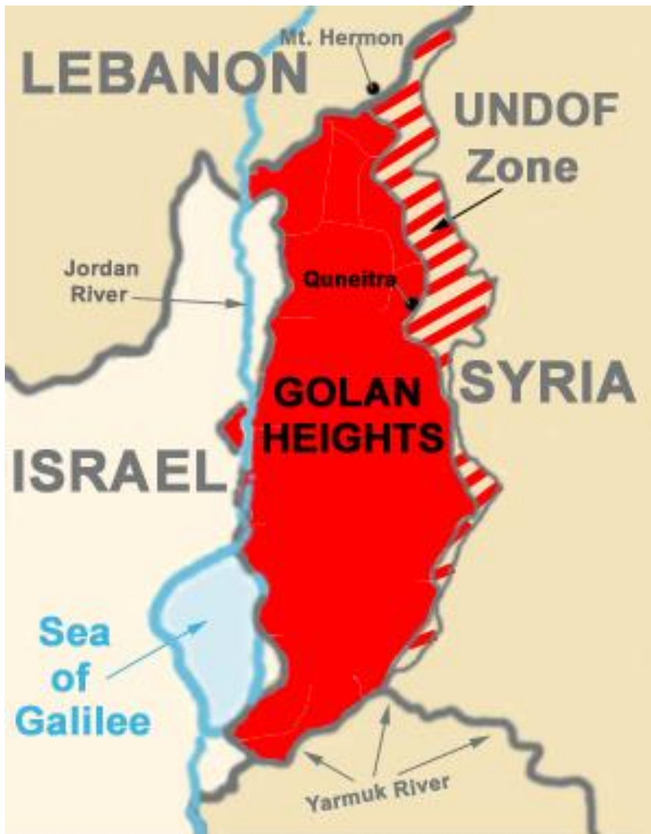
Golan Heights and international law

the 1933 Glass-Steagall Act, in effect opening the floodgates to the US financial crisis of 2007-2015. Michael Steinhardt the hedge-fund speculator is a philanthropic friend of Israel, of Marc Rich and a board member of Woolsey's neo-con Foundation for the Defense of Democracies. And Jacob Lord Rothschild is a former business partner of convicted Russian oil oligarch, Mikhail Khodorkovsky. Before his arrest Khodorkovsky secretly transferred his shares in Yukos Oil to Rothschild. Rothschild is a part-owner of Genie Energy which in 2013 was granted exclusive oil and gas exploration rights to a 153-square mile radius in the southern part of the Golan Heights by the Netanyahu government. In short, it's quite an eye-popping board.