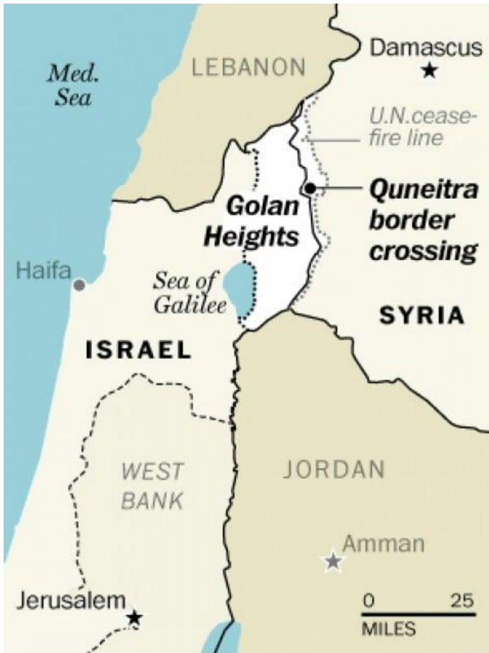
The Washington Post

Netanyahu demand American recognition of Israel's 1981 annexation of the Golan as an "appropriate salve to Israeli security concerns in the wake of the nuclear deal with Iran." Energy war has been a significant component of US, Israeli, Qatari, Turkish, and, until recently, Saudi, strategy against Syria's Assad regime. Before the latest Golan Heights oil discovery, the focus on Assad pivoted on the huge regional natural gas resources of both Qatar and of Iran on opposite sides of the Persian Gulf, comprising the largest known gas discovery in the world to date.